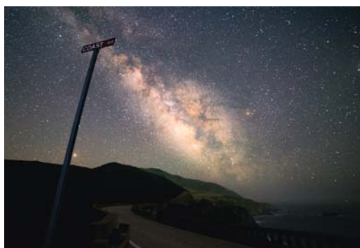
04 - Coast Road.jpg