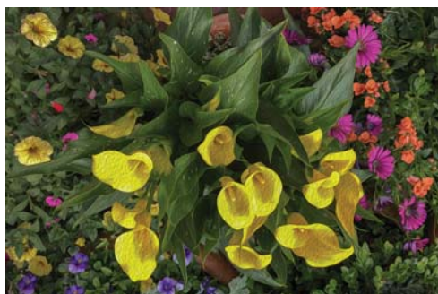
03 - Beautiful Flowers at MPCC.jpg