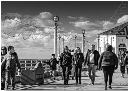
25 - Windy day on the pier.jpg