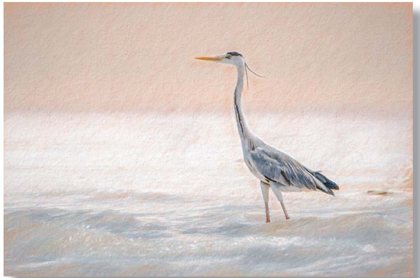
Grey Heron on Beach Julie Chen